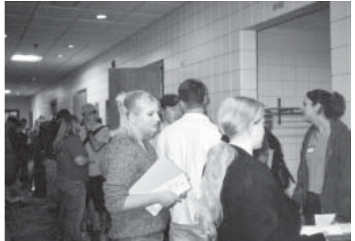
Registration at MENC Day