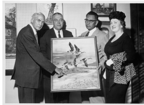
Stilwell Student Juried Exhibition