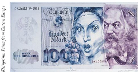
Kleinprints: Prints from Eastern Europe

In the last month of the spring semester, the John A. Day Gallery showcases several thesis exhibitions produced by both Master of Fine Arts and Bachelor of Fine Arts candidates. These professional exhibitions are the final component of a fine arts degree at the University of South Dakota.