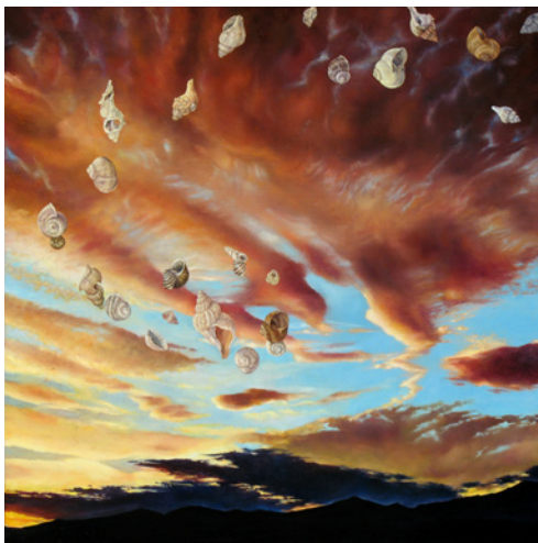
Ricki Klages, Restless Traveler